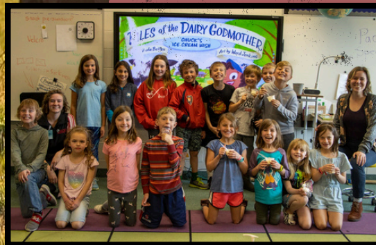
The MFB Foundation donated over $5,000 in ag accurate books, worksheets, activities and promotional materials to classrooms, libraries and community youth programs.