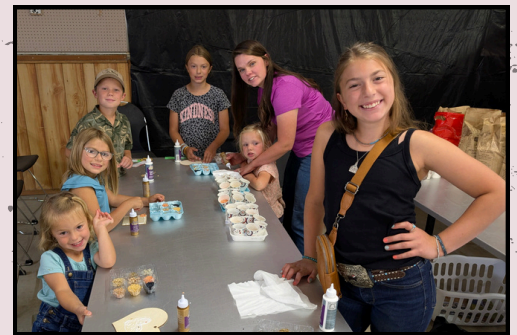
Families visiting the Montana State Fair made seed mosaics with Montana grown crops and learned about how they become food on the table in the Ag Building.