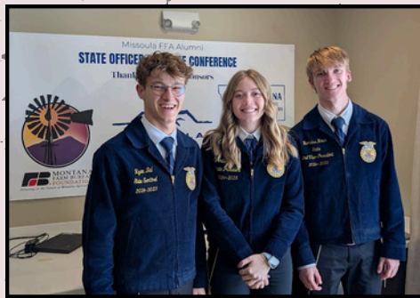
Montana State FFA Officers at the State Officer Candidate Conference which trains high school seniors on interview skills, sponsored by MFBFo.

Every year, the Montana Farm Bureau Foundation raises the bar by investing more in our programs, boosting donations, awarding more in scholarships, and increasing grant funds.