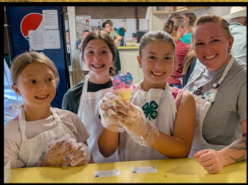
The MFB Foundation provided ice cream coupons for youth 4-H exhibitors at the 2025 Montana State Fair.