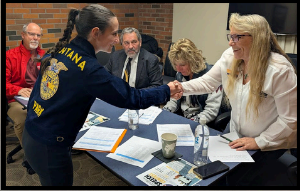
MFB Foundation Board Members enjoy judging the youth speech contest and hearing their take on current agriculture topics and their future goals.