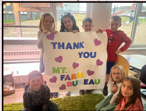
1 st graders at Cascade Elementary received a mini-grant to purchase an indoor hydroponics grow system for their classroom. The equipment will be used annually!