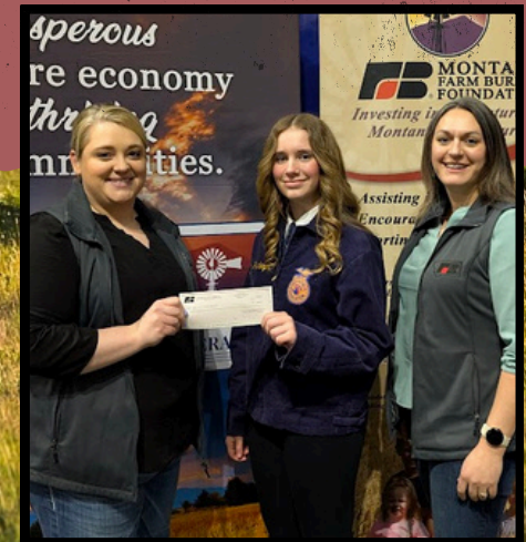
Over $1,000 was awarded to the top five winners in our Youth Speech Contest.