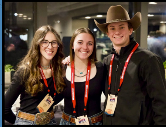
Over $15,000 was donated to the State and National Young Farmer & Rancher Leadership Conferences and attendees.